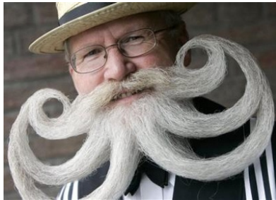
THIS MAN CLEARLY WON THE BEARDS CONTEST BACK IN THE EIGHTEEN-NINETEEN-FOURTEENS. YE OLDE CARNIVALE!